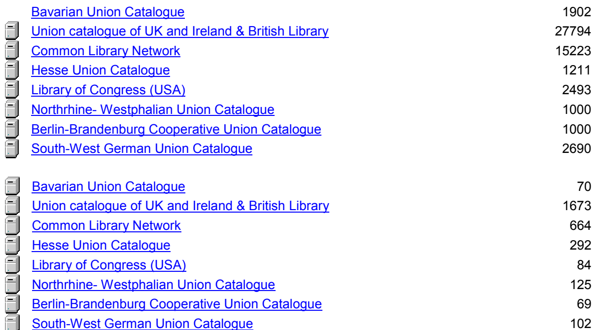
Figure 8a. Hits in GBV for Information Technology; 8b the same query when one limits the search to a specific year, in this case, 2000. 157

Most websites are constructed on the assumption that more hits are better. Suppose a user wants to find a specific title: GesamtKatalog der Wiegendrucke . If they search in GBV, they get 211 locations. In TEL they find 115 locations. Such quantitative information about locations is sometimes vitally important. Normally, however, a user wants to know which copy is closest to where they are, instead of receiving 325 additional locations. In future, we need to integrate goals of users into our interfaces. Of course, when we are searching for titles under a specific subject, we want as many hits as possible. For instance, if we search for linear perspective in GBV we receive 396 hits. In TEL the same search gives us 118 hits.